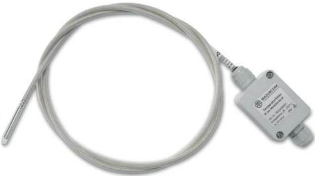
Temperature sensor with flexible protective tube

The small MG 00 plastic housing (protection rating IP 64) at the end of the PFA protective tube permits problem-free connection of a line. The maximum usage temperature of the temperature sensor is 200°C.