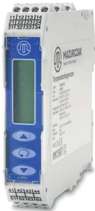
Temperature limiter ETB 200

The temperature sensor approved by TÜV in compliance with DIN EN 14597, in combination with our certified TF 24-160/SMG00-M temperature sensor, represents a standardscompliant temperature limitation system. The electronics